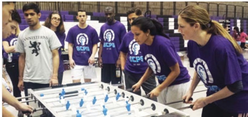
In March, students showed their school spirit by participating in the All-University Games. Each school team competed in games such as tug-of-war, dodgeball, foosball, volleyball, and more.