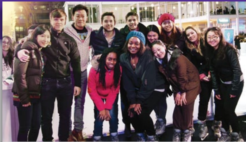
The Office of Student Life hosted a series of events around New York City, including an "Ice Skating Social" at Bryant Park. Students got to mingle in the VIP Lounge and ice skate at the Bryant Park Ice Rink this past February.