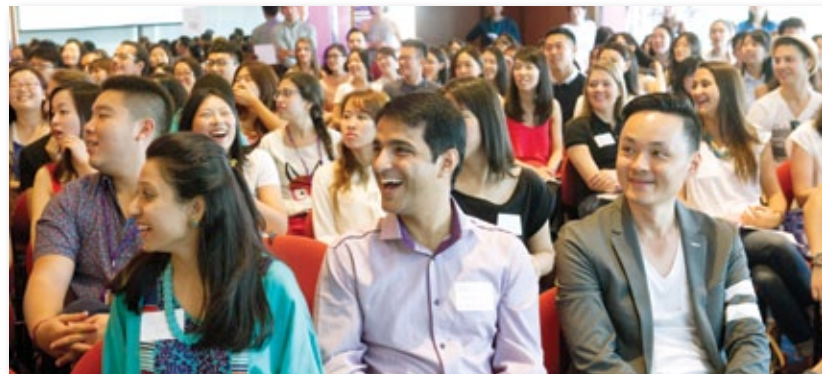
The International Student Support Center and the Office of Student Life co-hosted a “welcome luncheon” for our new incoming international graduate students in August. More than 450 students from 73 countries attended the event.